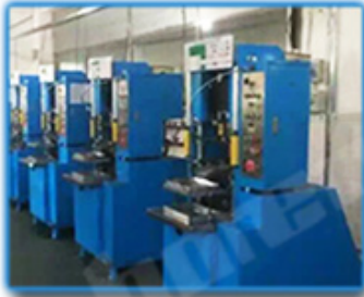
● Cold Press Mschine