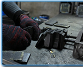
● Remove The Mold