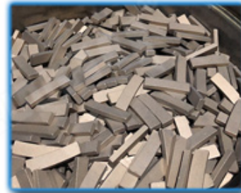
● The Product Polishing