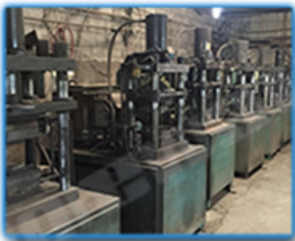
● Hot Press Machinery