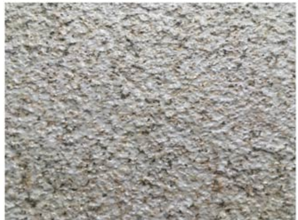
Coarse flowers and fine flowers can be adjusted at will.