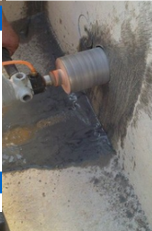
Diamond CNC drill bit