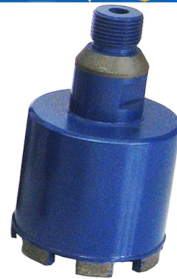
Boreway Machinery Co., Ltd. www.diamondtools.top www.boreway.com