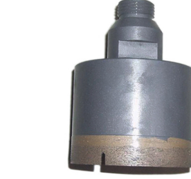
Diamond coring drill bit

Boreway Machinery Co., Ltd. www.diamondtools.top www.boreway.com