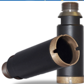
Boreway Machinery Co., Ltd. www.diamondtools.top www.boreway.com