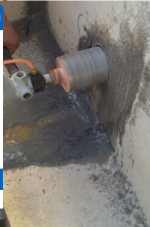
Diamond CNC drill bit