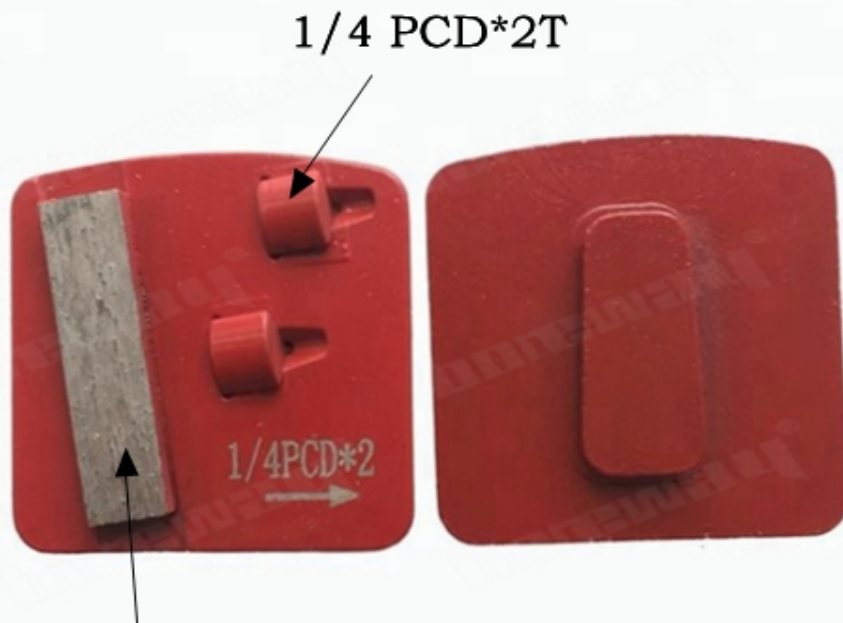
Diamond Segment 40*10*5mm*1T