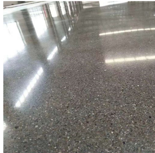
After Grinding and Polishing