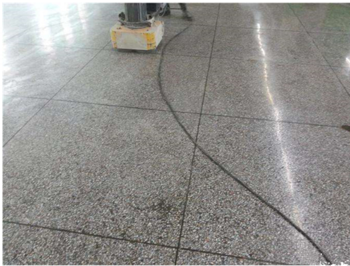
Before Grinding and Polishing