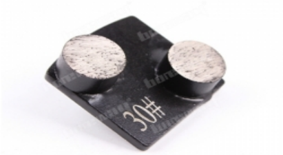
Boreway Machinery Co.,Ltd www.diamondtools.top www.boreway.net