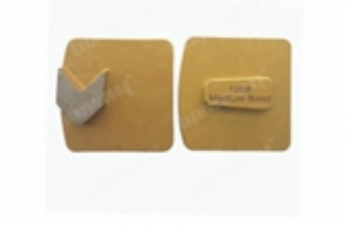
Boreway Machinery Co.,Ltd www.diamondtools.top www.boreway.net