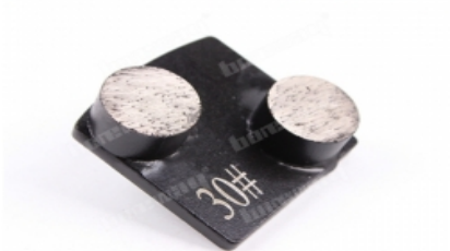
Boreway Machinery Co.,Ltd www.diamondtools.top www.boreway.net