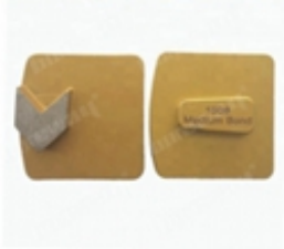
Boreway Machinery Co.,Ltd www.diamondtools.top www.boreway.net