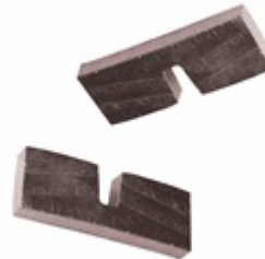
U Slot Edge Segment