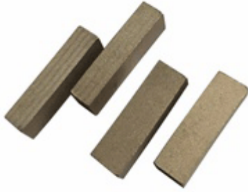
Normal Shape Edge Segment