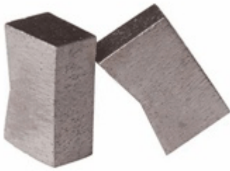
K Shape Block Segment