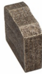
M Shape Block Segment