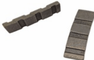
Turbo Shape Edge Segment