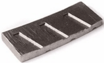
Slant Slot Edge Segment