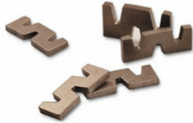
W Shape Edge Segment