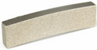
Fan Shape Edge Segment