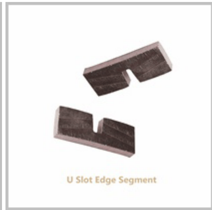
U Slot Edge Segment