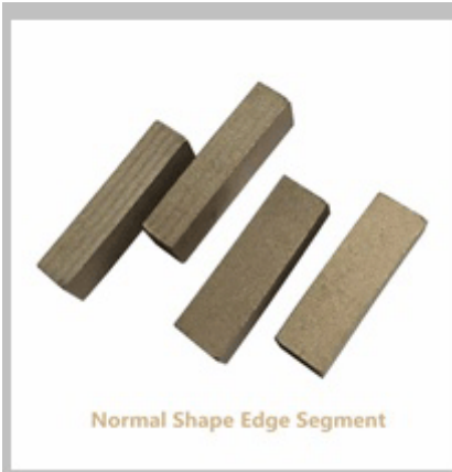
Normal Shape Edge Segment