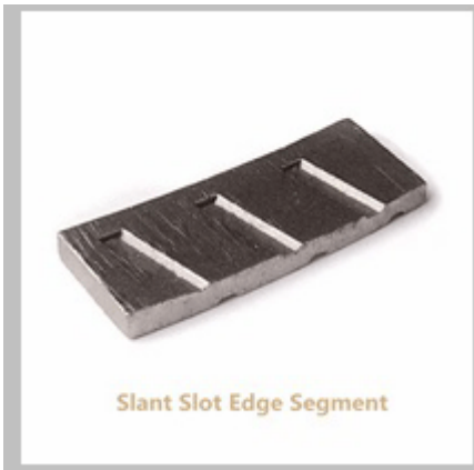
Slant Slot Edge Segment