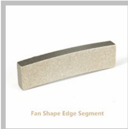
Fan Shape Edge Segment