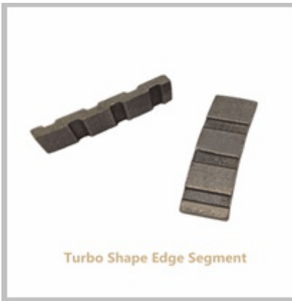
Turbo Shape Edge Segment