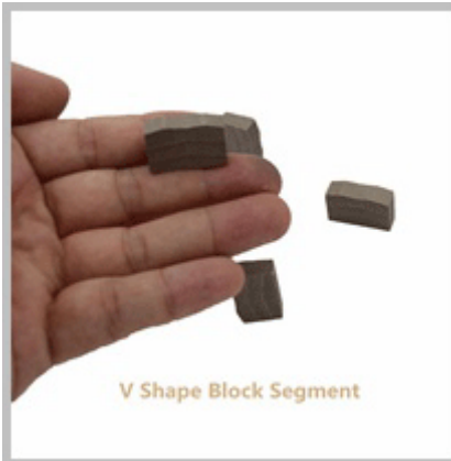
V Shape Block Segment