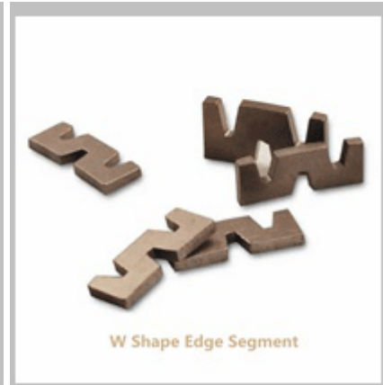
W Shape Edge Segment