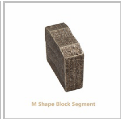
M Shape Block Segment