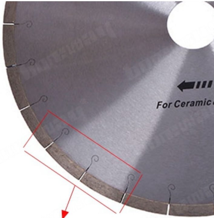
Fish Hook Slot, Not easy to break edge