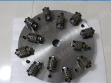
Boreway Machinery Co., Ltd www.diamondtools.top www.boreway.com