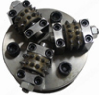
Boreway Machinery Co., Ltd www.diamondtools.top www.boreway.com