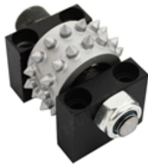
Boreway Machinery Co., Ltd www.diamondtools.top www.boreway.net