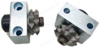
Boreway Machinery Co., Ltd www.fordiamondtools.com www.diamondtools.top