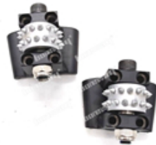
Boreway Machinery Co., Ltd www.fordiamondtools.com www.diamondtools.top