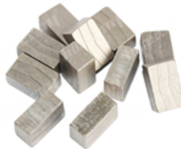
Boreway Machinery Co., Ltd www.diamondtools.top www.boreway.net