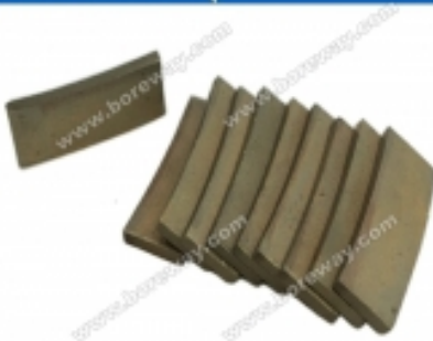
Boreway Machinery Co., Ltd www.boreway.com