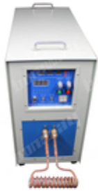
Three Phase 380V 30kW High Frequency Induction Welding Machine