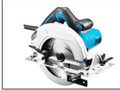
Circular Saw Machine