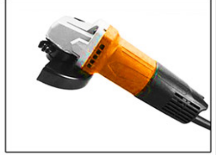
Hand Held Angle Grinder