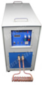
Three Phase 380V 30kW High Frequency Induction Welding Machine