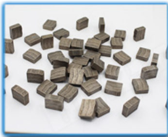
● Hot Press Machinery