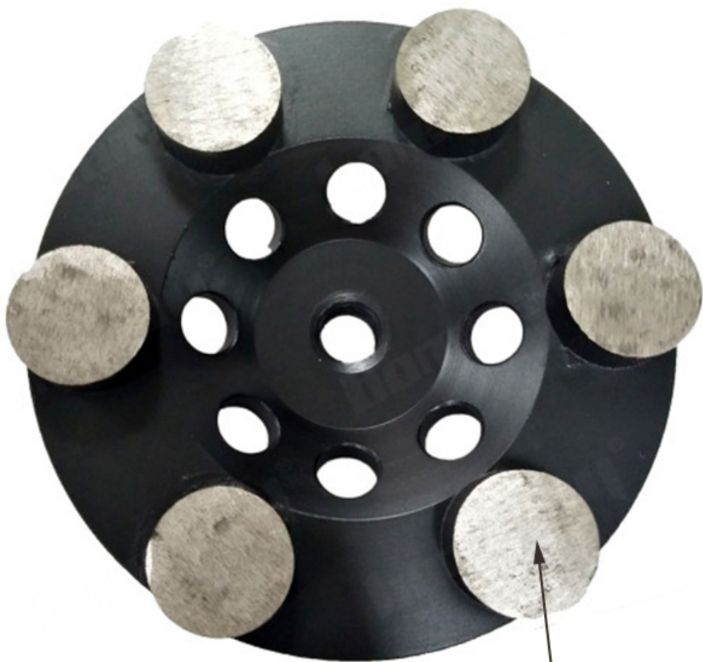
D25mm*H12.5mm*6T Six Diamond Segments