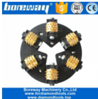
HTC 270MM 45S Litchi Surface Plate