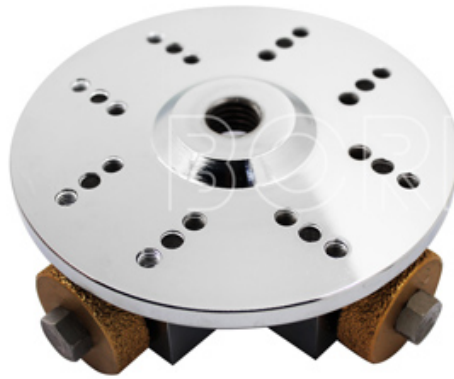
D125x4TxM14 Single Layer Plate