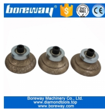
O20xM10 Continuous Diamond Router Bit