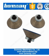
Metal Continuous Diamond Router Bits