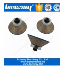
Metal Continuous Diamond Router Bits