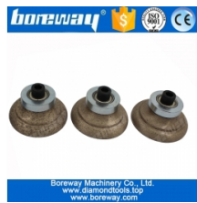
O20xM10 Continuous Diamond Router Bit