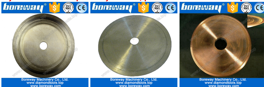
Electroplate jade cutting blade

If you do not see the product you want , please contact us for more product images .