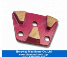
3 Trapezoid Grinding Shoes