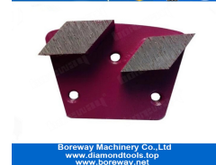
2 Rhombus Grinding Shoes