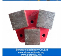
3 Square Grinding Shoes