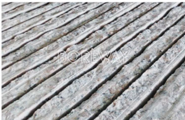
Cutting Effect Of Saw Blade Segment In The Market

We have segments Type: Layer Type, "K" type, "V" Type, Grooved Type, M Type, Taper Type etc. Cutting granite from over 500 kinds of granite in many countries. That have the main feature of fast cutting and long lifespan.