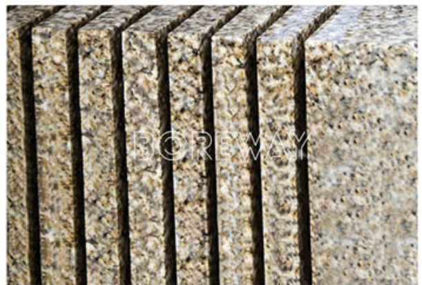
Cutting Effect Of Our Saw Blade Segment