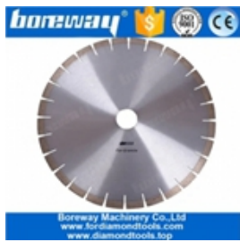
Diamond Saw Blades for Granite