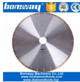
Diamond Disc Saw Blade for Marble