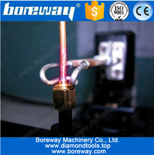
Copper tube welding