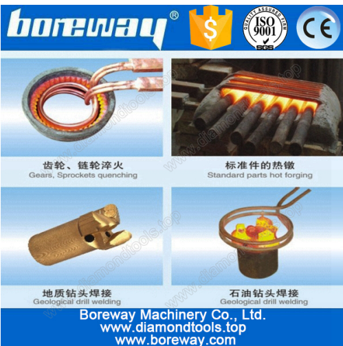
A variety of materials welding

Annex:Foot switch/hand-press switch,heating coil(can be customized),water pipes,water pumps(need to buy).