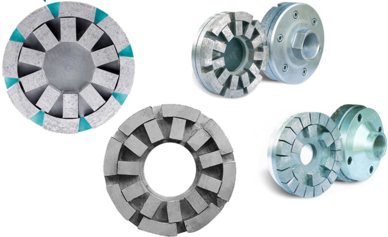
Diamond Satellite Abrasive Wheel Tool