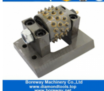
45s Frankfurt Bush Hammer Blodk