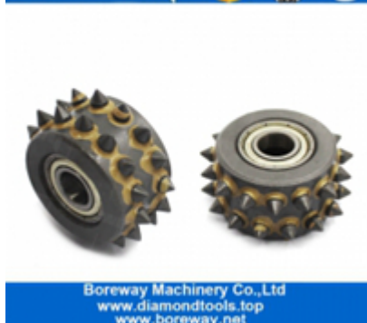
30s Worth Buying Bush Hammer Tools