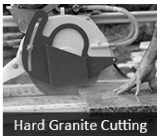
Hard Granite Cutting