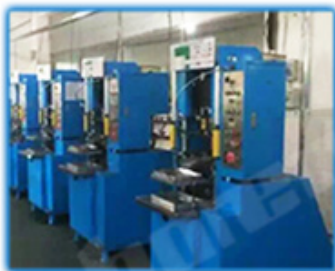
● Cold Press Mschine