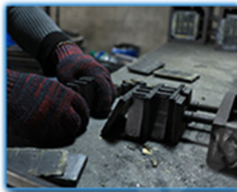
● Remove The Mold