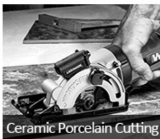
Ceramic Porcelain Cutting