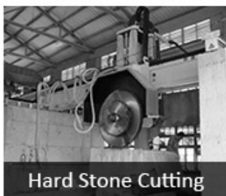
Hard Stone Cutting