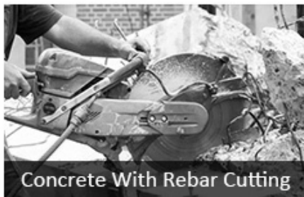
Concrete With Rebar Cutting