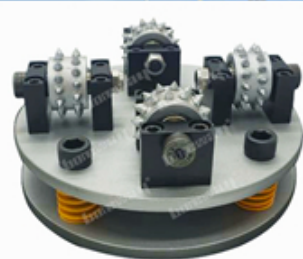
Boreway Machinery Co., Ltd. www.fordiamondtools.com www.diamondtools.top