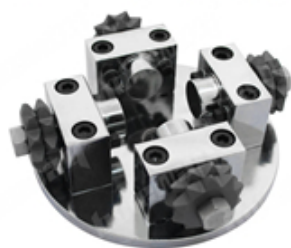
Boreway Machinery Co., Ltd. www.diamondtools.top www.boreway.net