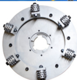
Boreway Machinery Co., Ltd. www.fordiamondtools.com www.diamondtools.top