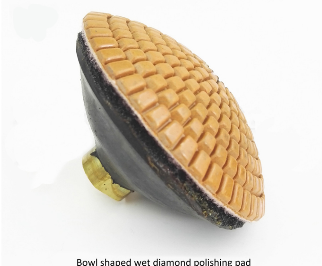
Bowl shaped wet diamond polishing pad

Boreway Machinery Co., Ltd. www.diamondtools.top www.boreway.com