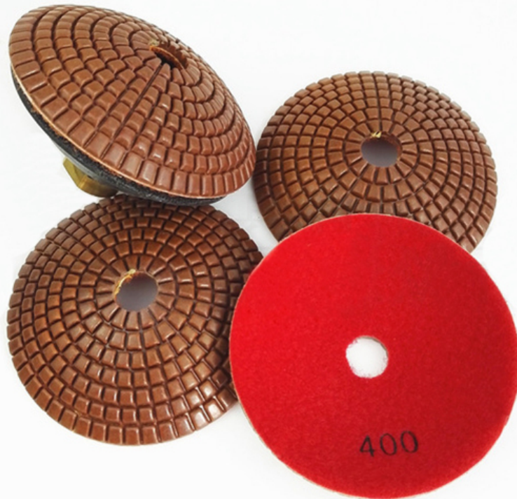
Bowl shaped wet diamond polishing pad

Boreway Machinery Co., Ltd. www.diamondtools.top www.boreway.com