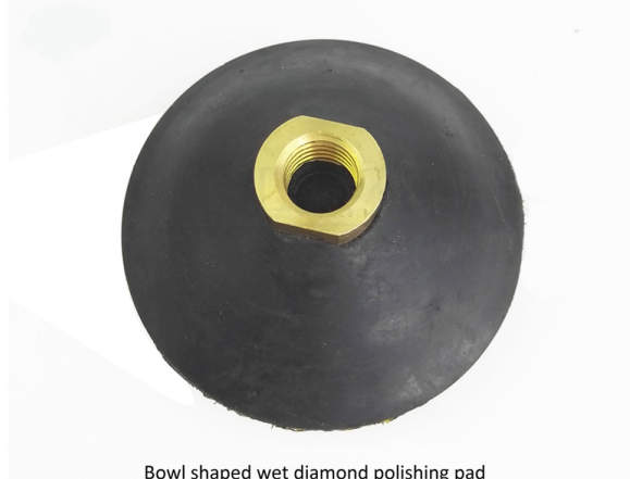
Bowl shaped wet diamond polishing pad

Boreway Machinery Co., Ltd. www.diamondtools.top www.boreway.com