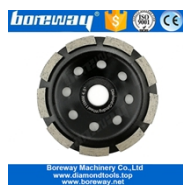
4.5 Inch Diamond Grinding Cup Wheel