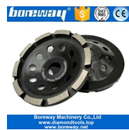
5 Inch Diamond Grinding Cup Wheel