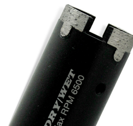
Diamond construction drill bit

Boreway Machinery Co., Ltd. www.diamondtools.top www.boreway.com