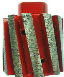
Boreway Machinery Co., Ltd. www.diamondtools.top www.boreway.com