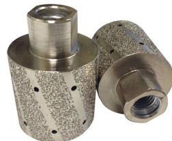
Boreway Machinery Co., Ltd. www.diamondtools.top www.boreway.com