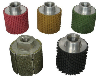
Boreway Machinery Co., Ltd. www.diamondtools.top www.boreway.com