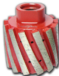
Boreway Machinery Co., Ltd. www.diamondtools.top www.boreway.com