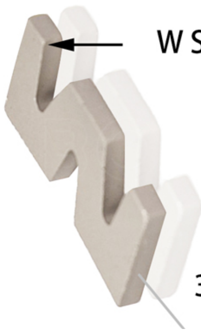
W Shape Segment

000000000 000000 00 000 0000000000 00000000 000000000 00000 00000 0000