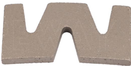
Special design W-type diamond saw blade segment

Prolong the service life of saw blade and reduce cutting friction.