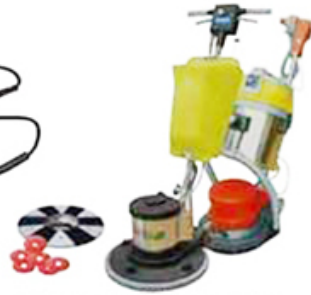
Floor polishing machine