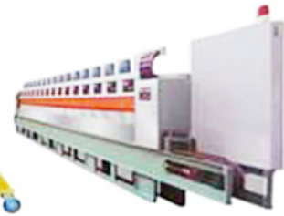
Ceramics polishing machine