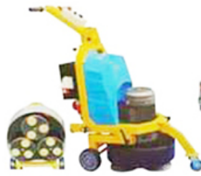
Large floor polishing machine