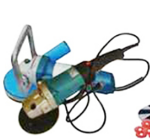
hand polishing machine

本公司代理: 各种型号 抛光机 抛光盘 抛光垫, 各种规格 抛光粉 抛光膏, 各种规格 抛光液, 各种规格 抛光剂, 各种规格 抛光蜡