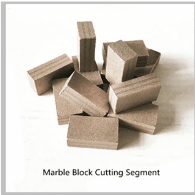
Marble Block Cutting Segment