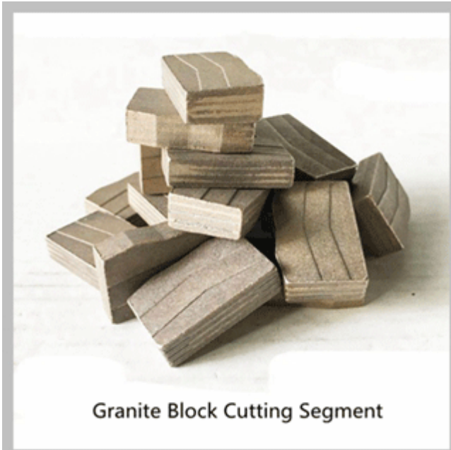
Granite Block Cutting Segment