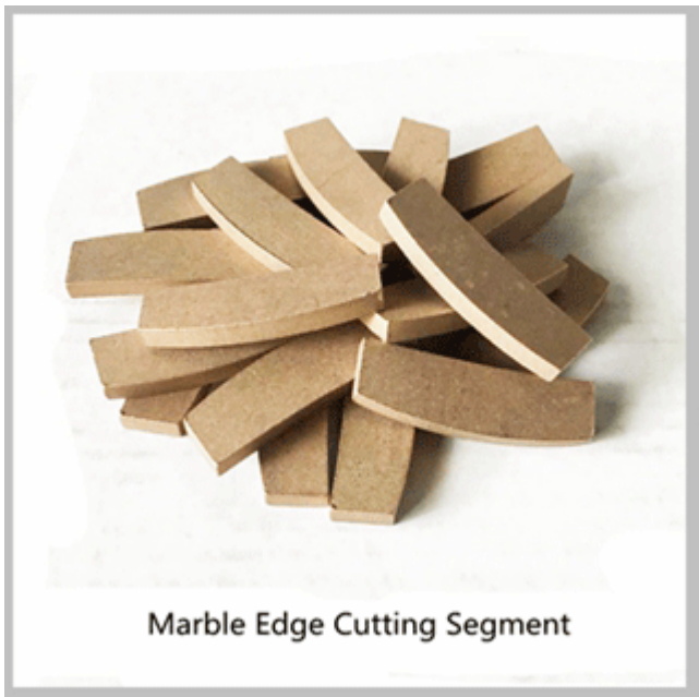
Marble Edge Cutting Segment