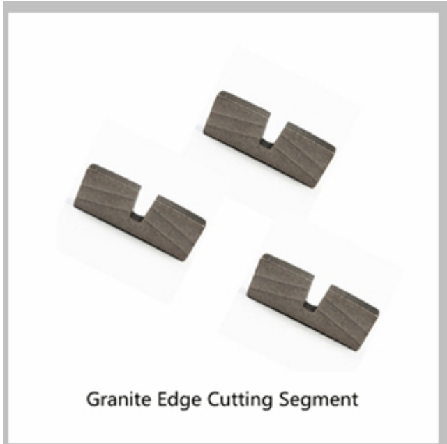
Granite Edge Cutting Segment