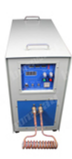
Three Phase 380V 30kW High Frequency Induction Welding Machine