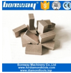
Marble Block Cutting Segment