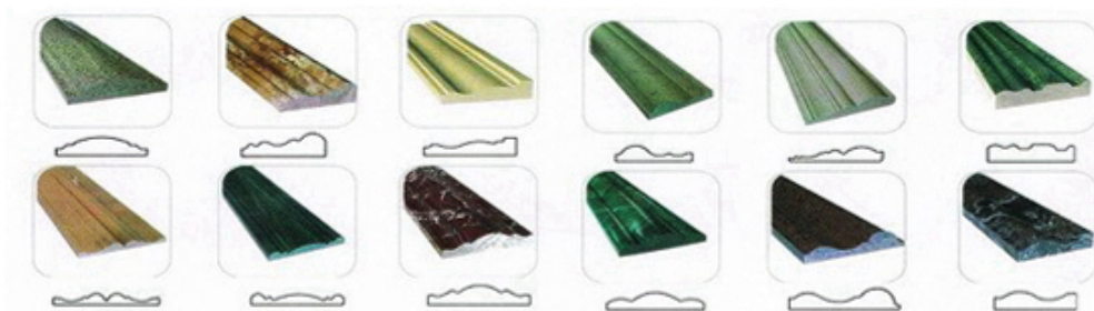
异形磨边效果 Type of profile stone