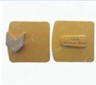
Boreway Machinery Co.,Ltd www.diamondtools.top www.boreway.net