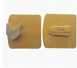
Boreway Machinery Co.,Ltd www.diamondtools.top www.boreway.net