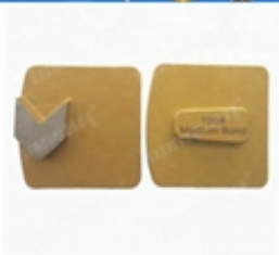
Boreway Machinery Co.,Ltd www.diamondtools.top www.boreway.net