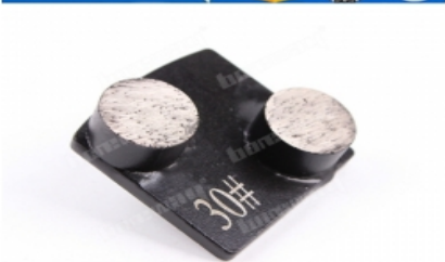
Boreway Machinery Co.,Ltd www.diamondtools.top www.boreway.net