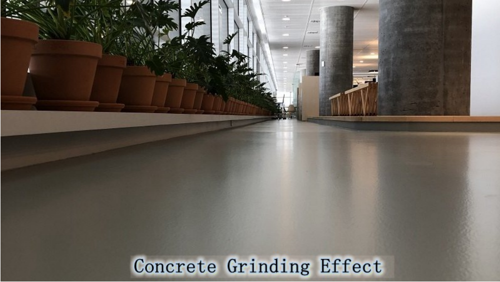
Concrete Grinding Effect