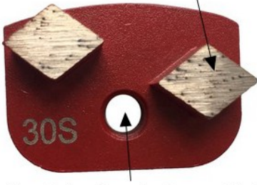
Connection Type: Polar Magnetic System; Single Hole System

Segment Size: 18mm*20mm*2T Segment Shape: Rhombus