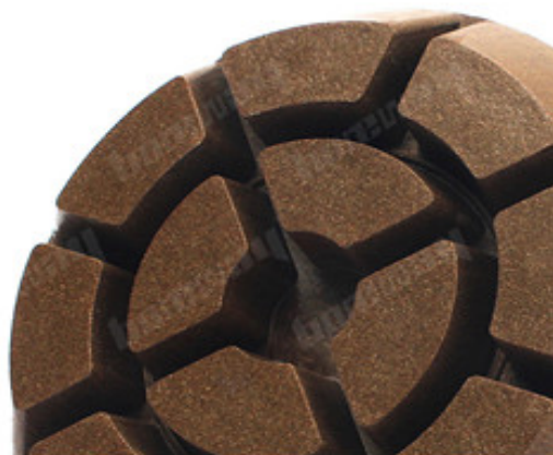
Boreway Machinery Co.,Ltd www.diamondtools.top www.boreway.net