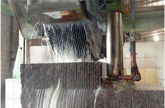
Single Saw Blade