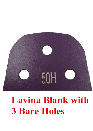
Lavina Blank with 3 Bare Holes