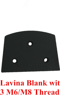
Lavina Blank with 3 M6/M8 Threads