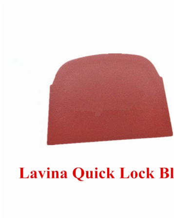
Lavina Quick Lock Blank