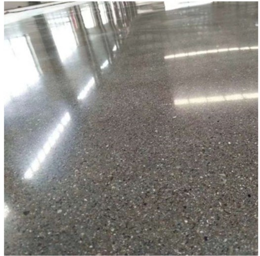
After Grinding and Polishing