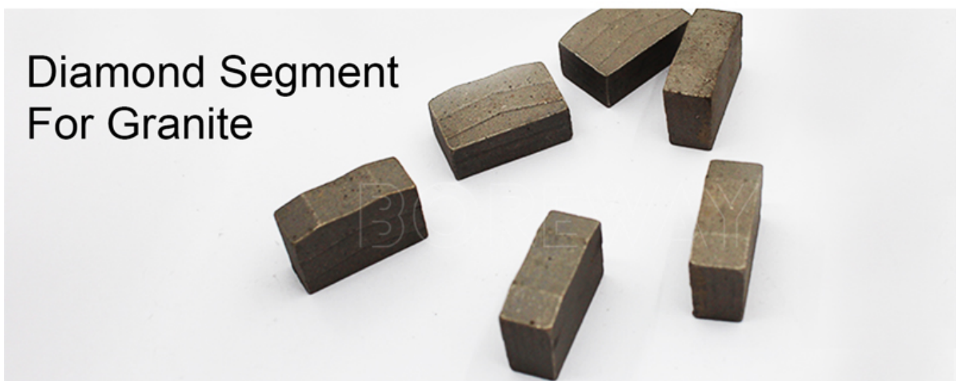
Diamond Segment For Granite