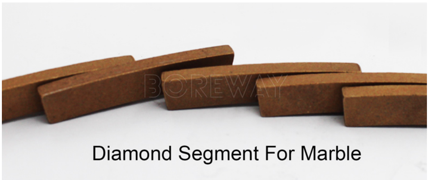
Diamond Segment For Marble