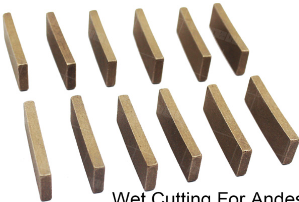
Wet Cutting For Andesite