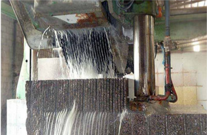
Single Saw Blade