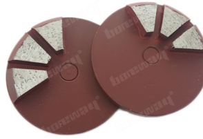
Boreway Machinery Co.,Ltd www.fordiamondtools.com www.diamondtools.top