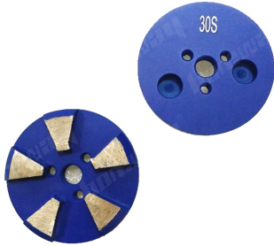
Boreway Machinery Co.,Ltd www.diamondtools.top www.boreway.net