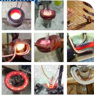
Three Phase 380V 30kW High Frequency Induction Welding Machine Three Phase 380V, 20kW, 50Hz, High Frequency Induction Welding Machine